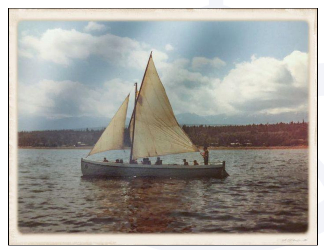
Royal Canadian Sea Cadets HMCS Quadra PL Course 1973